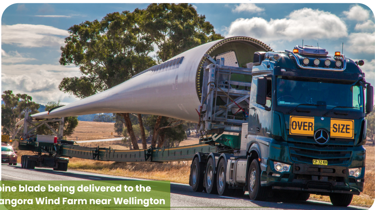
Turbine blade being delivered to the Bodangora Wind Farm near Wellington

Delivery of wind turbine components is scheduled for November 2022 to March 2023, to be confirmed.